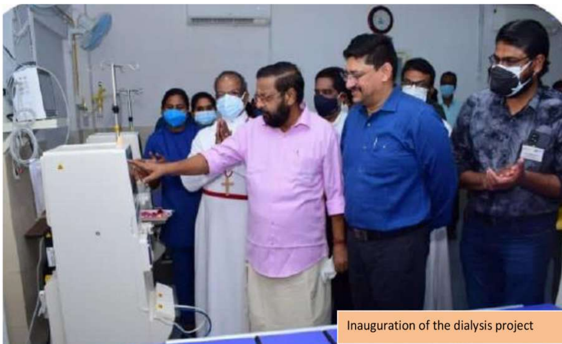
Inauguration of the dialysis project

operations during the flood of 2018. We helped many villagers by cleaning and rejuvenating the wells affected by the floods.