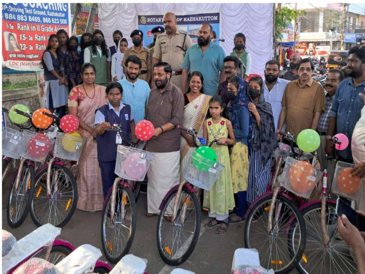
Bicycles distributed for girl students

Having a roof over the head is still a wild dream for many. In spite of the efforts of the governments, local bodies and other institutions this is still a grey area. We also played our role by constructing twelve dwelling units during the previous years. Presently we are constructing houses by participating in the project Udayakiran of Trivandrum South Club. This is a project partly financed by Chittilapally Foundation. Three houses are complete and others are in various stages. □