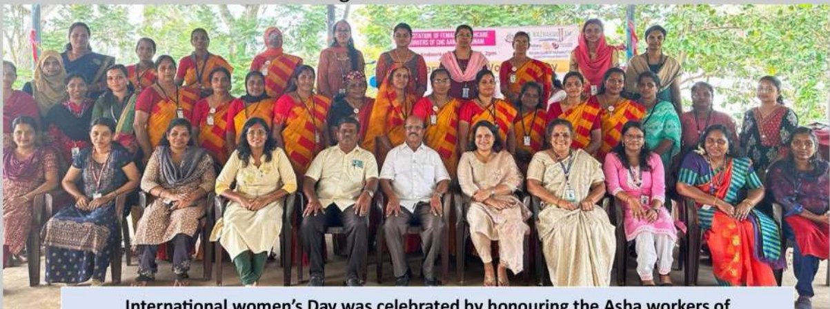
International women's Day was celebrated by honouring the Asha workers of Andoorkonam Panchayat. Project done in association with the IMA