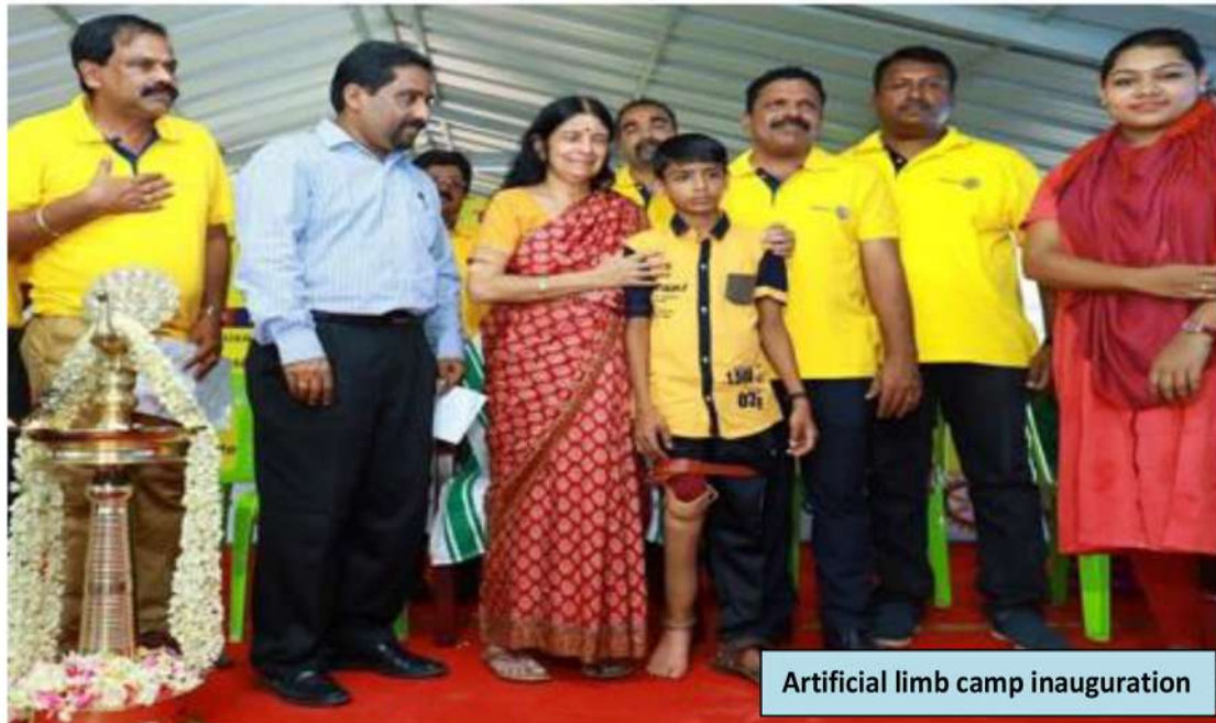
Artificial limb camp inauguration

The year 1917-18 saw the most humanitarian project when we donated 105 artificial limbs to the physically challenged. We repeated this project again during 2023-24 in association with Trivandrum Central club when 132 artificial limbs were distributed. We were also involved in the flood relief